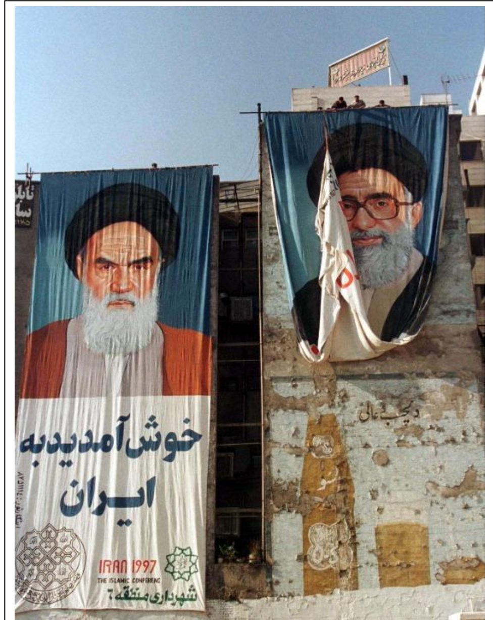
Teacher and student: portraits of Iran's supreme leaders, Tehran, November 1997.

"The history of our nation is in a black, bitter, and bloody chapter, mixed with varieties of hostility and spite from the American regime. [That regime] is culpable in 25 years of support of the Pahlavi dictatorship, with all the crimes it committed against our people. The looting of this nation's wealth with the shah's help, the intense confrontation with the revolution during the last months of the shah's regime, its encouragement in crushing the demonstrations of millions of people, its sabotage of the revolution through various